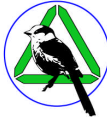
Canadian Cooperative Wildlife Health Centre